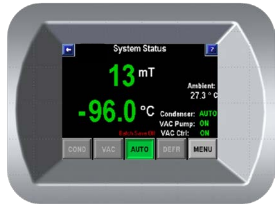
Omnitronics™ Touch-Screen Controller