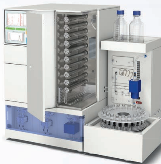
Prep SFC M5 with carousel collector