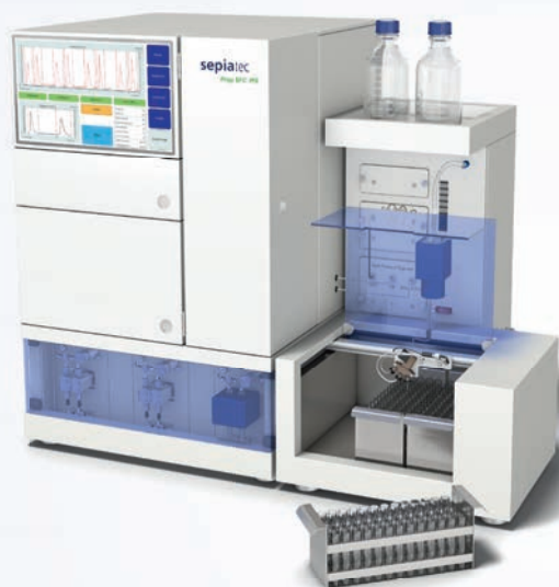
Prep SFC M5 with XY-collector

An integrated system controller and a 15.6" TFT touch screen are used to input all data for sample separations. No additional computer is needed, reducing the space required for the Prep SFC M5 system to a width of just 92 cm.