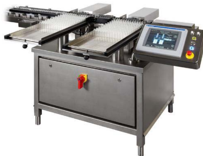
TL-200 Tray Loader - Assuming 305 mm (12 in) Wide Tray